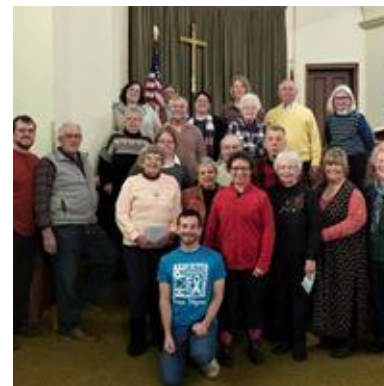
"Yes!!! ALL are welcome at Memorial Presbyterian! Come join us!!"

We are a close family of nurturing and compassionate believers who support each other and our community through fellowship, worship, and mission.