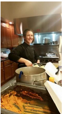
"United in God's Love" – Community Thanksgiving Dinner

The United Church of Phelps reaches out and welcomes all people so they may worship God passionately, become people of prayer, develop a deep faith, demonstrate faith through service, and share their faith."