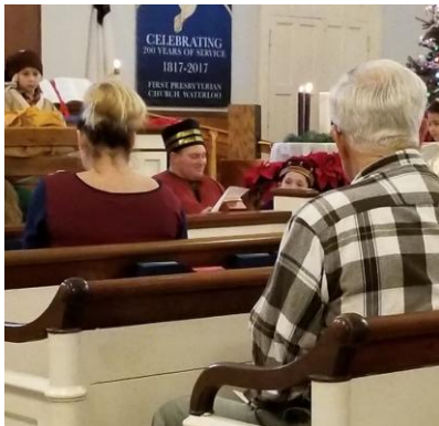
Celebrating 200 years

“This church is committed to serving the broader community at large. The Friday free lunches each week not only feed people but connect people to check on each other.”