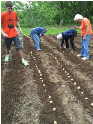
We grow potatoes, too!

"We are a church family seeking personal and spiritual growth through praying, experiencing worship, building relationships and serving in mission, locally and globally."