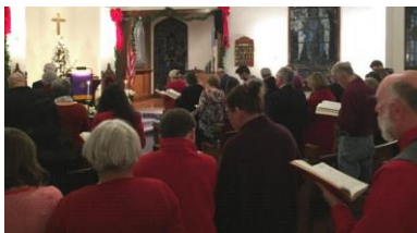
Gathering for worship

Under the terms of the Plan of Union of 1801 between Congregationalists and Presbyterians in New England and New York, the congregation was identified sometimes as Congregational and sometimes as Presbyterian during the 1800's. It became Presbyterian to stay in 1913.