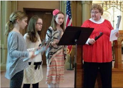
The Children's Chimers play in Sunday worship.

The Friday Men's Bible Fellowship meets weekly and all men of the community are welcome to attend. No preparation or previous Bible study experience is necessary.