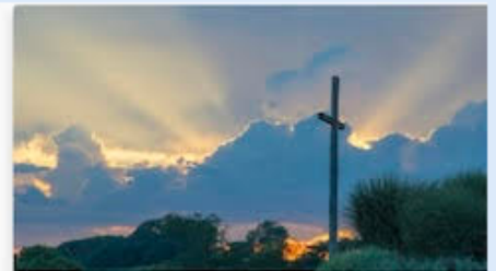
Individual per capita contribution