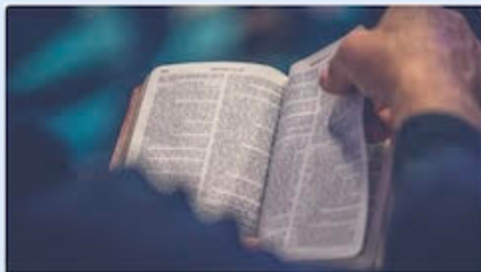
Presbytery of Geneva General Fund